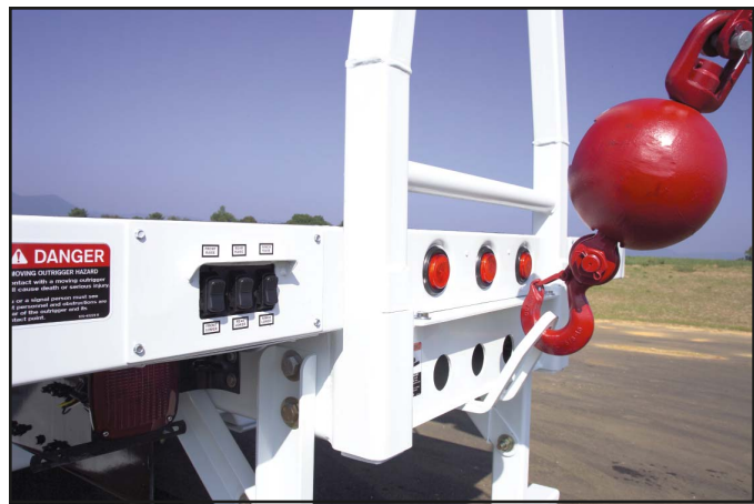
Easy Load Block Stowing