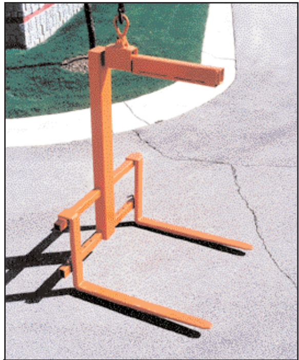
ADJUSTABLE PALLET FORK

WEIGHT 340 LBS. CAP 3700 LBS. @ 24" L.C.